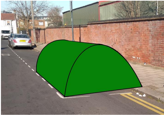
Example secure cycle parking unit. This example is for visualisation purposes only and does not represent what is proposed or implemented

We are proposing to introduce a secure cycle parking unit on Yewfield Road as shown on the enclosed plan. The proposed secure cycle parking unit would be located near the junction of Yewfield Road and Roundwood Road. The secure cycle parking unit will take half a car parking space.