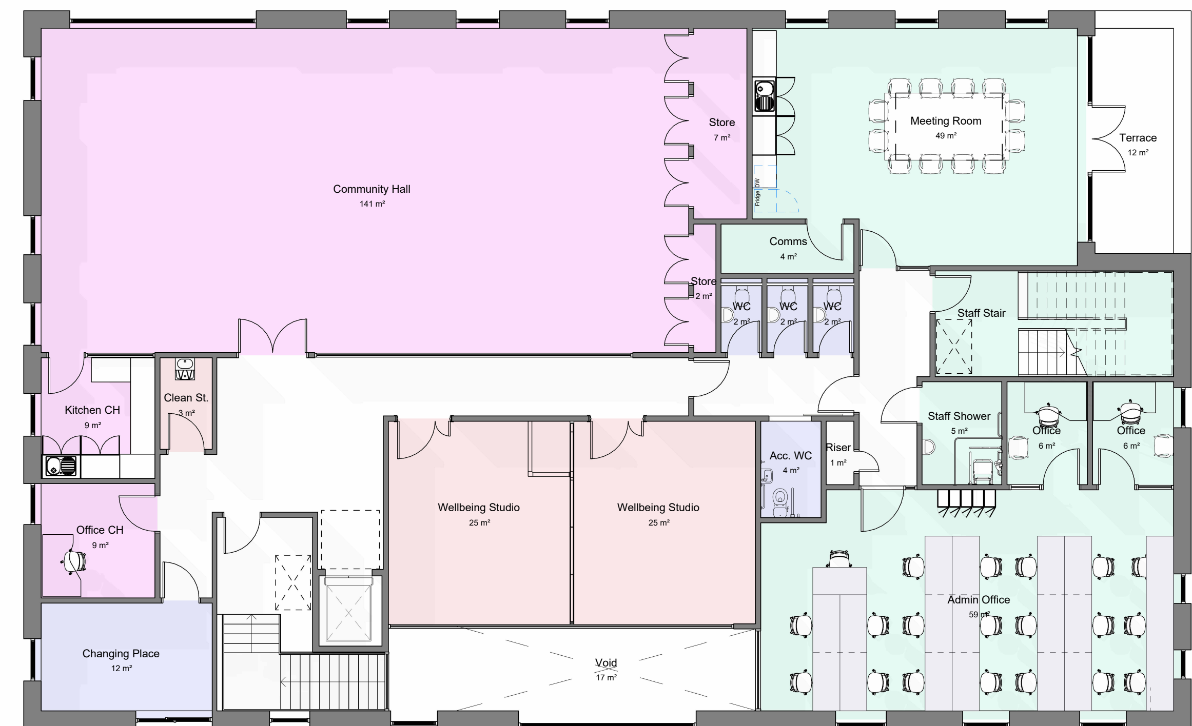
2 10 - First Floor 1:100