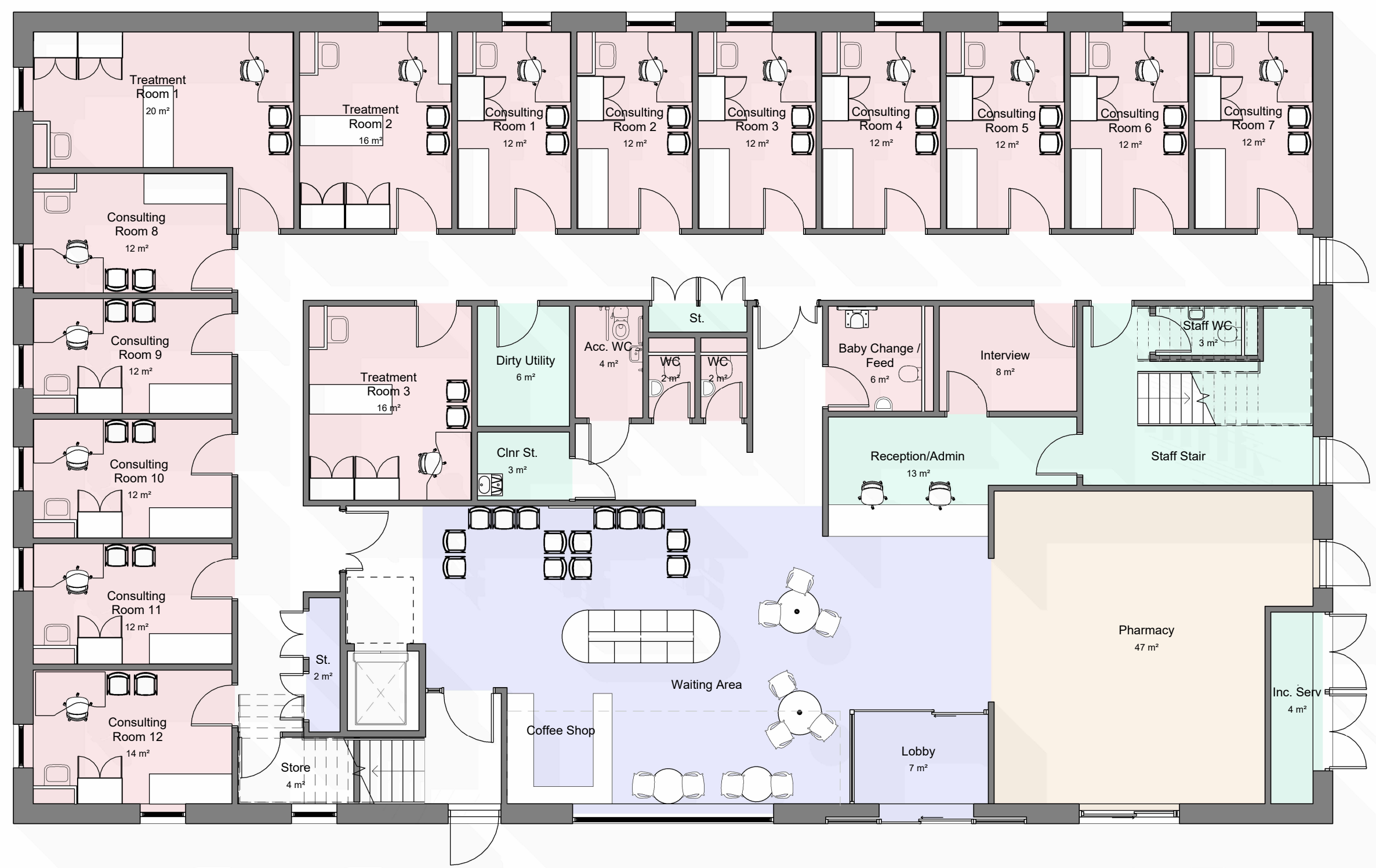
1 00 - Ground Floor 1:100