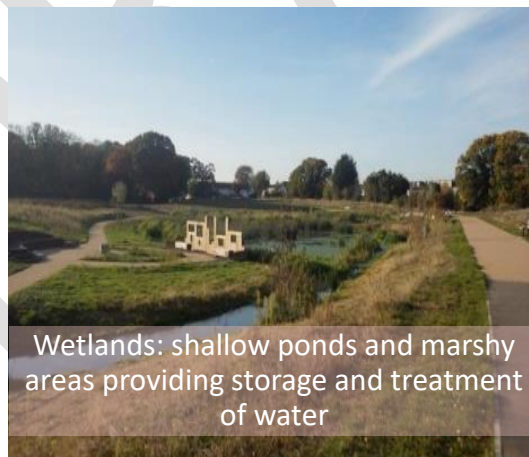
Figure 5.1: Examples of different types of Sustainable Drainage Systems

More information on different types of SuDS and their benefits can be found on the SusDrain website . Given the urbanised nature of Brent, it is important to promote the use of SuDS which manage rainwater as close to the source as possible and simulate nature which is environmentally beneficial. They can most commonly be implemented in new developments but can also be retrofitted to existing