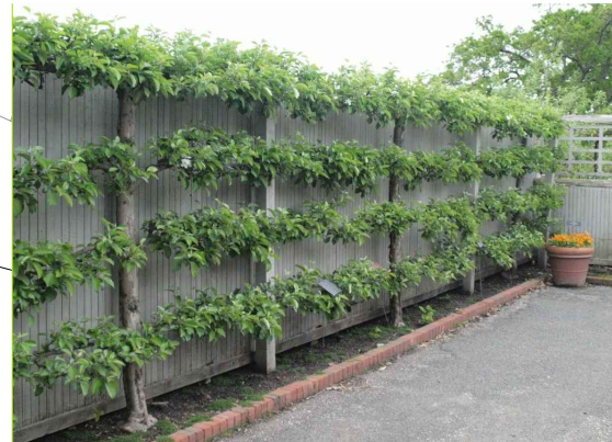
Espalier trained Apple trees along fence