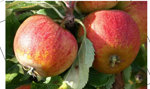
Cox's Orange Pippin