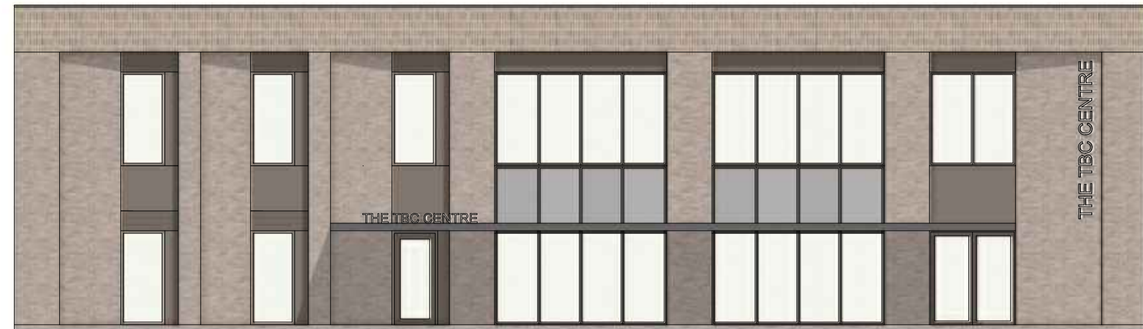
1 South Elevation 1:100