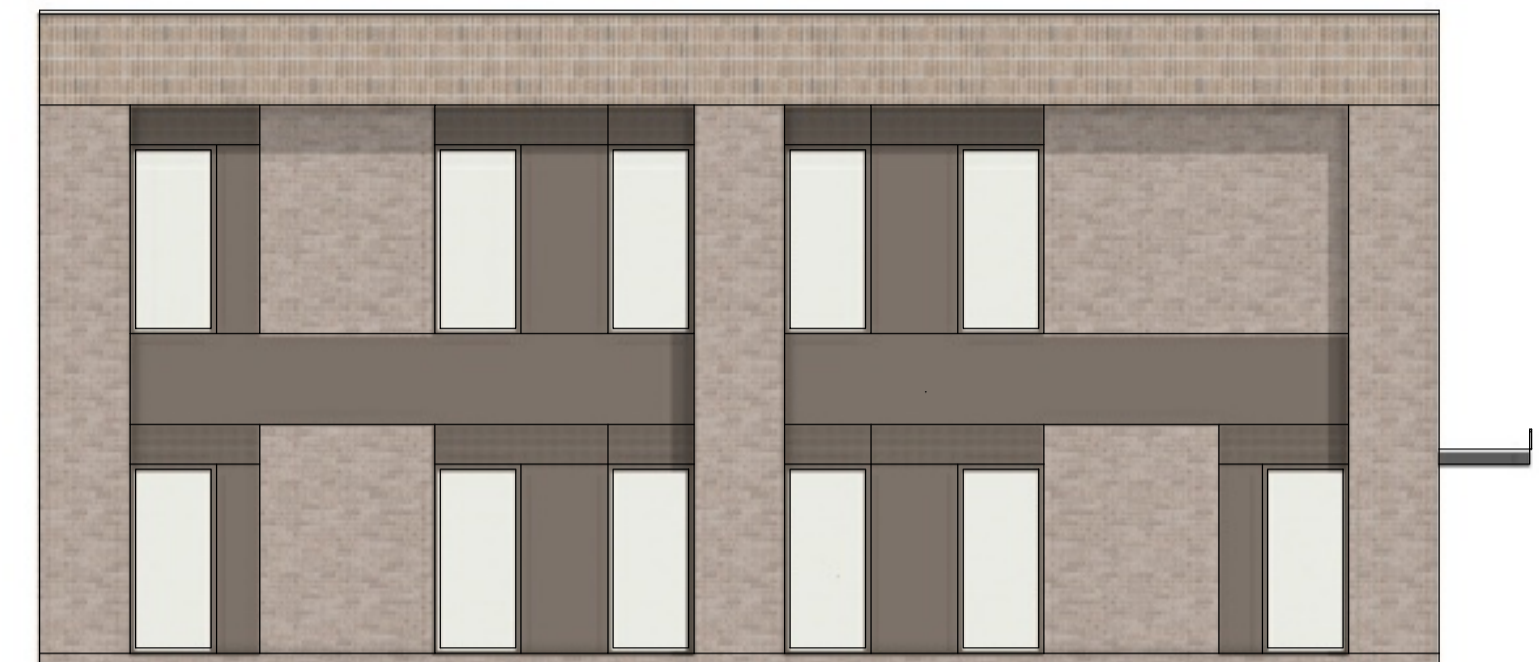
2 West Elevation 1:100