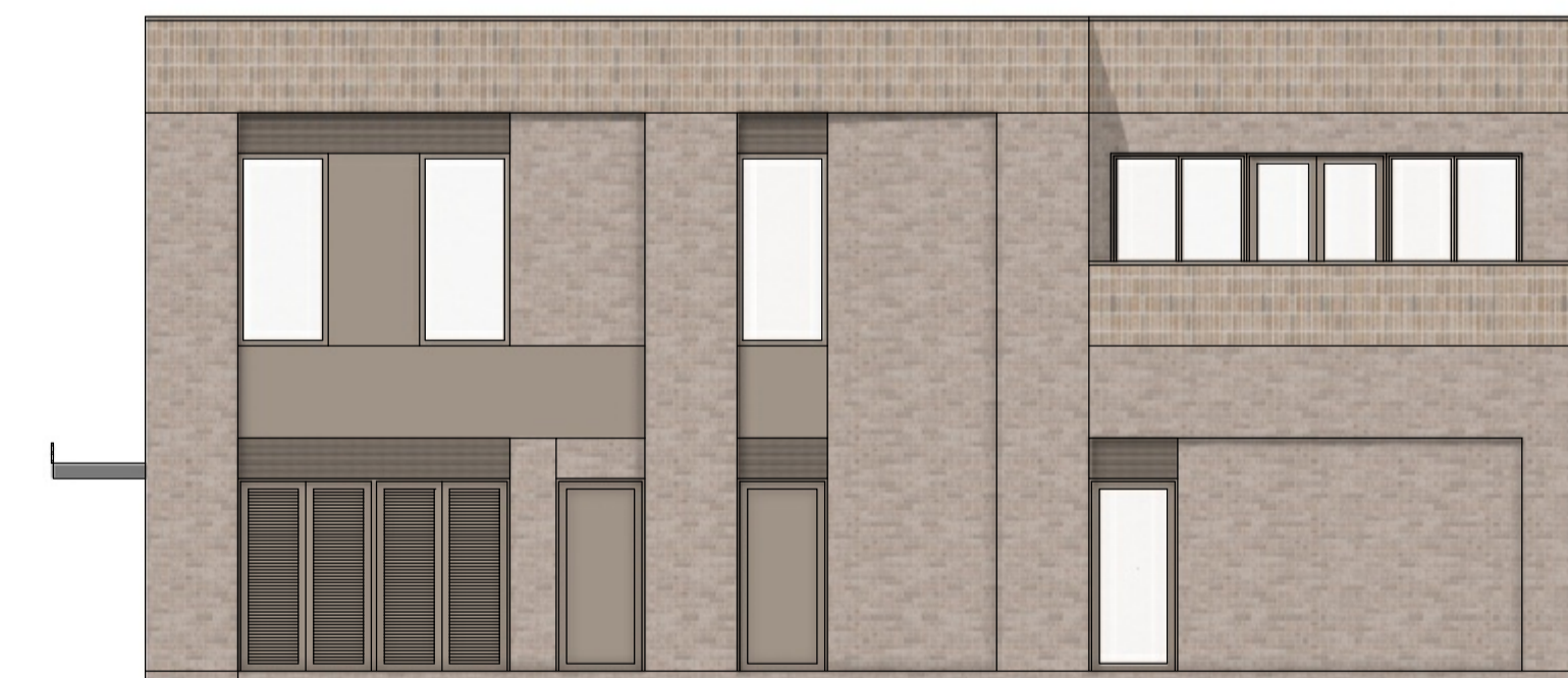
4 East Elevation 1:100