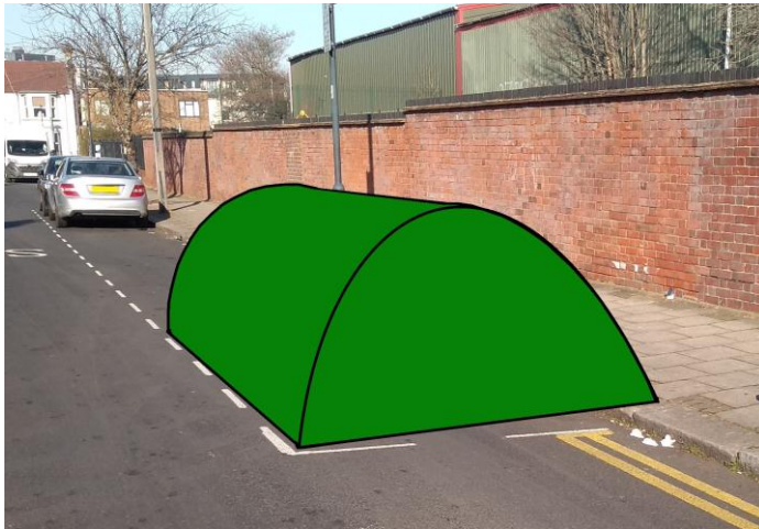
Example secure cycle parking unit. This example is for visualisation purposes only and does not represent what is proposed or implemented

We are proposing to introduce a secure cycle parking unit on District Road as shown on the enclosed plan. The proposed secure cycle parking unit would be located near the junction of District Road and Allendale Road. The secure cycle parking unit will take half a car parking space.